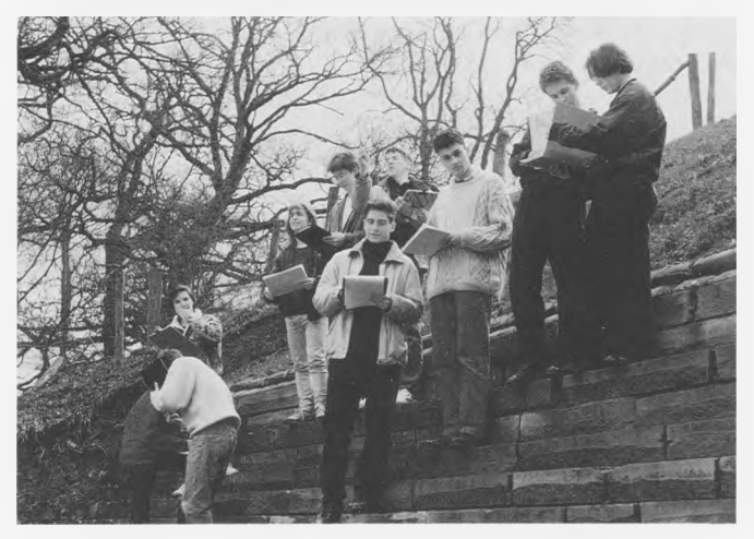
Searching for the rarely sighted Headstanding Quico Askew.

The course itself consisted of primarily two aspects of geography, namely coastal and glacial. The coastal side of the trip was undertaken on the Ynyslas dunes which