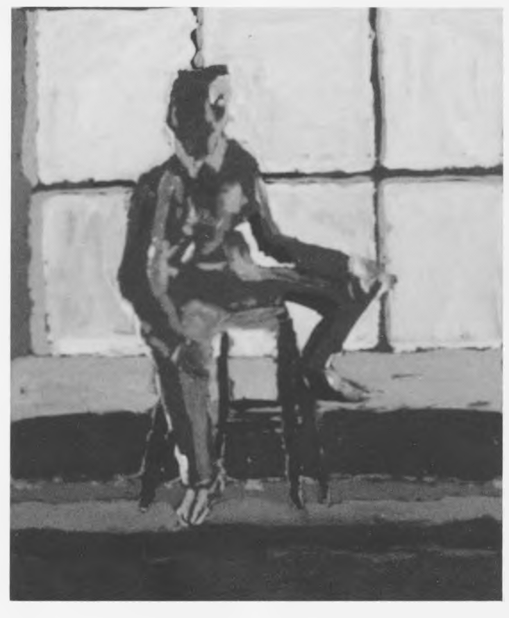
Ulrich Payne 3N Poster paint