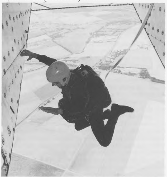
"That's one small step for a schoolmaster, one giant leap for Mankind"

After a couple of hours of anxious anticipation, schoolmaster is being kitted out, every move and facial expression being recorded by brother-in-law's video.