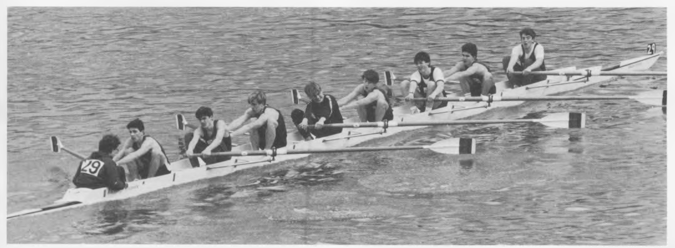
The 1st VIII at the Schools' Head of the River Race The J15 VIII after their win at Bedford

4th in that well-contested division. At the Henley Schools' Head, in rough and blustery conditions more reminiscent of the Tideway, the 1st IV had their best result of the season, finishing 9th overall and 4th out of 13 in the junior coxed IV's division. The J16 VIII also rowed very well to finish 20th overall, and 4th out of 14 in