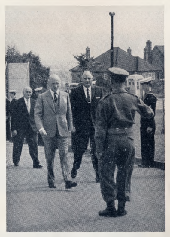
VISCOUNT CURZON GREETED BY L.T.-COL. PATTINSON