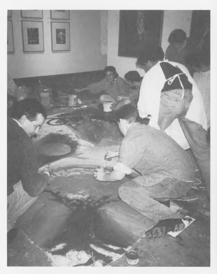
'Symbols & Transformations': an Art Workshop at Milton Keynes Exhibition Gallery.

Developments: The new Exhibition space was completed this year with an Exhibition programme devised to promote and reflect the broad nature of Art & Design related activities. The development of good facilities for the public display of work of students and artists working within the community is an important aspect of the work of our department. Such developments have a vital role to play in establishing a proper ethos for the place of the visual arts within the work of the school and the community.