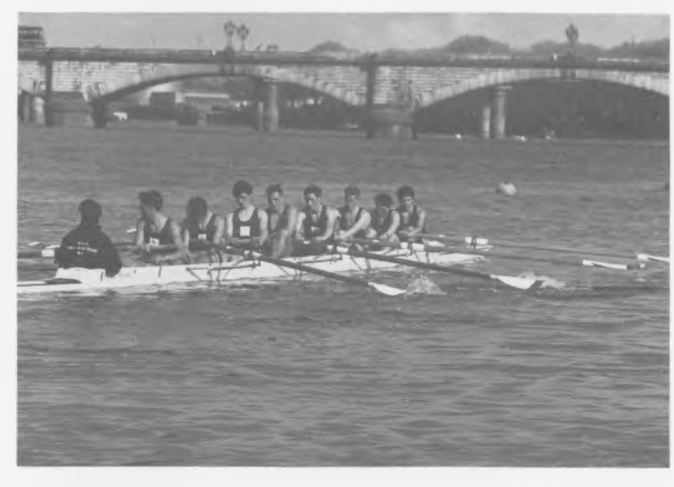
The 1989 J16 VIII

The J15's lost one of their most promising oarsmen with chronic knee problems after the "Head" season, and consequently had to spend the early part of the summer