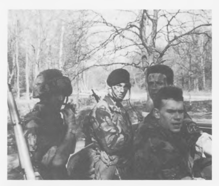
The Wild Bunch.

Several exciting visits have been undertaken, particularly to the Royal Artillery at Larkhill and a superb demonstration of firepower (including Harriers, A10's and Lynx helicopters!) at the School of Infantry at Warminster. As usual the Army Air Corps have visited us twice to give some of our boys short Helicopter flights in the smaller Gazelle (4 man) helicopter. These have been quite exhilarating.