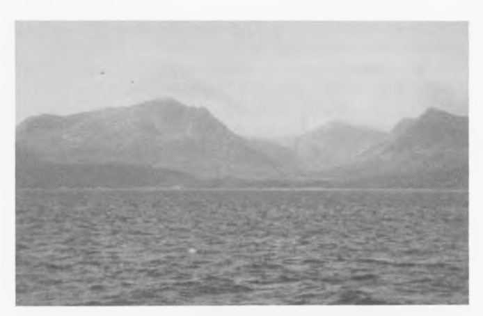
One of the many picturesque sights (East side of the Isle of Arran).

house in which we cooked, ate, slept, worked and played.